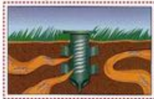
Bait System - Within 3 Months:

Termites MIGHT have found the monitors at this point. Although, many times it can take up to 18 MONTHS! However, unless there is sufficient activity, the FCO still might not apply any bait materials yet. Even if there is enough termite activity to bait, those critters are still feeding on your home too.