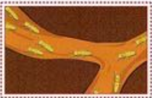
Termidor - A Few Days Later:

Termidor has been transferred to many in the colony. Many have already died, but the 'transfer effect' continues to kill those who have not even gone into the treated zone.