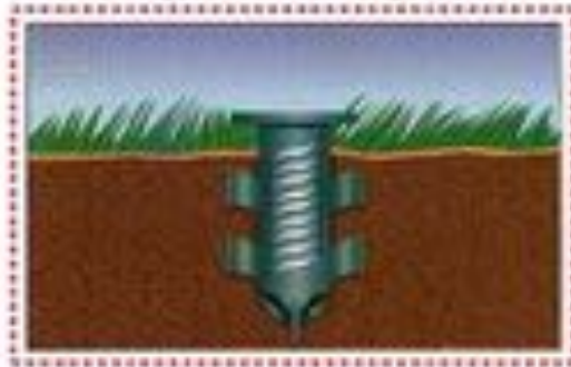
Bait System - A Few Days Later:

Still, there may be no activity in the stations. Just termites eating your home. oh darn.