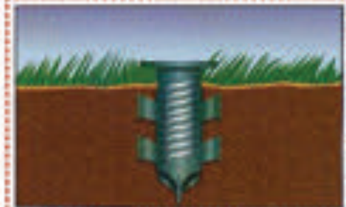
Bait System - Day One:

No termites have wandered into the monitoring/bait stations yet. Bummer.