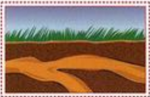
Termidor - Within 3 Months:

100% Control! NO MORE termites to damage your home. The Termidor is still in the soil around your home providing protection against any new invading termite colonies.